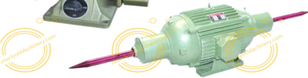
BENCH GRINDER HEAVY